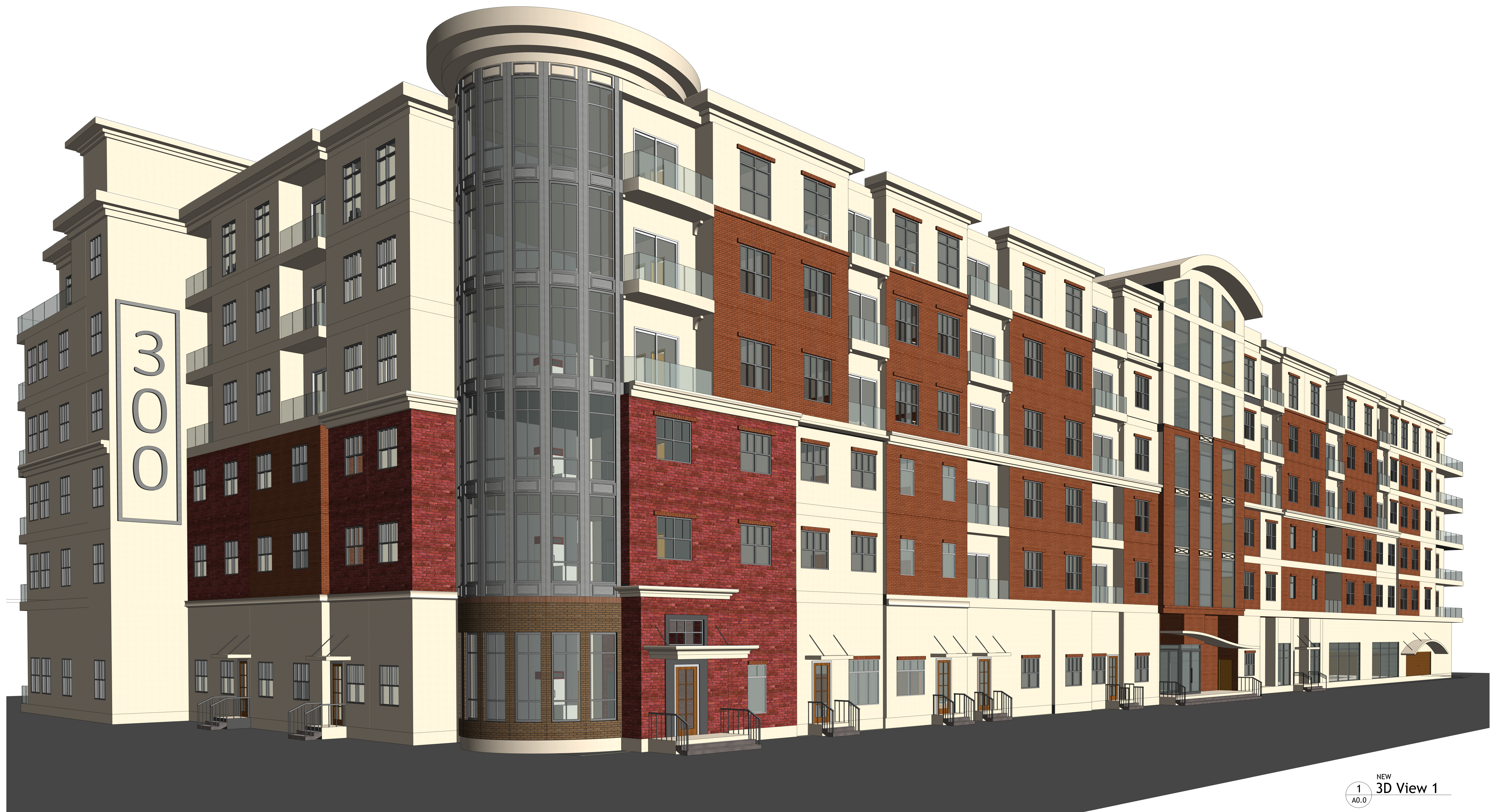
NEW 1 3D View 1 A0.0