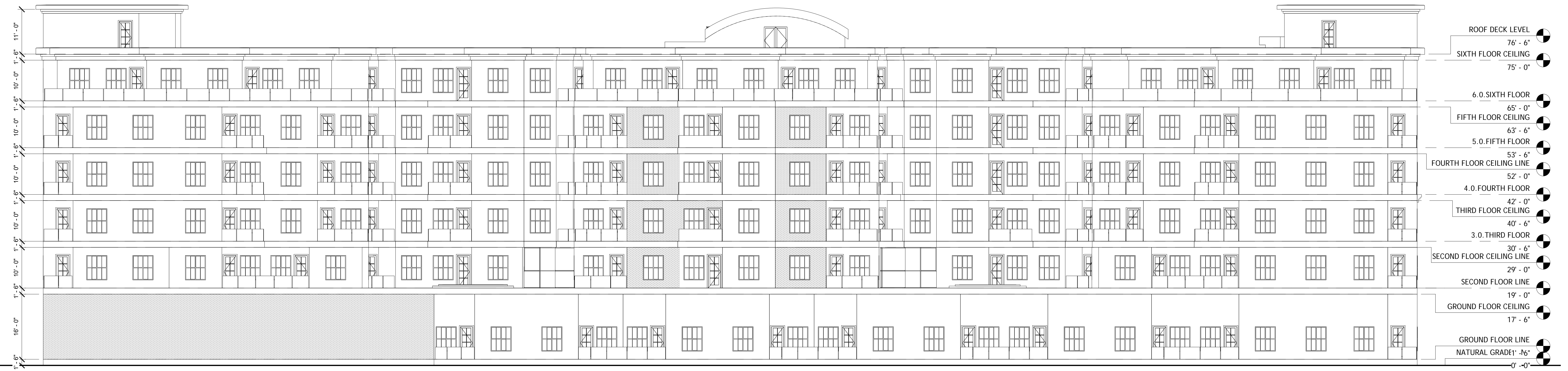
2 REAR ELEVATION A2.1 3/32" = 1'-0"