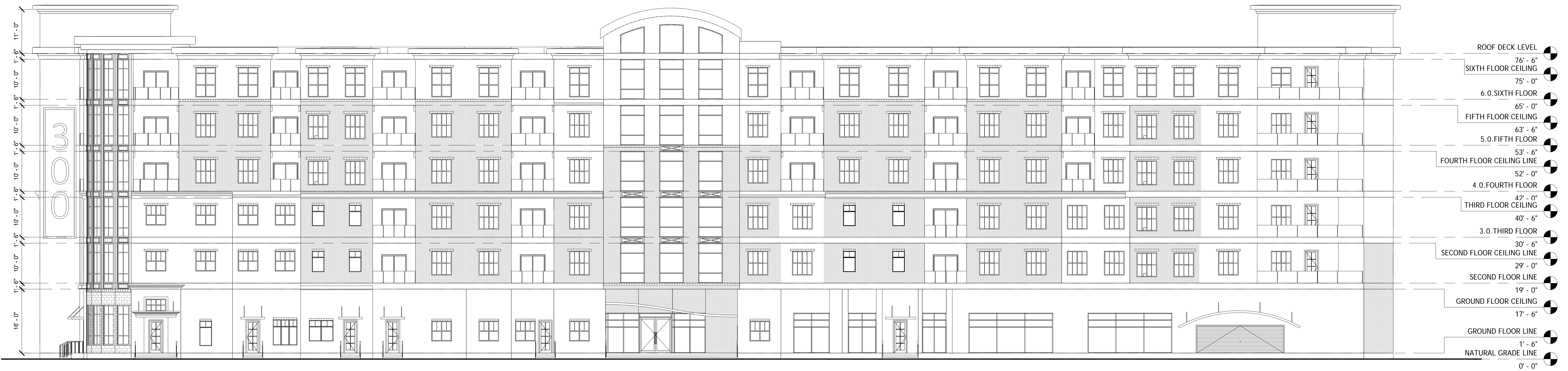
1 FRONT ELEVATION A2.1 3/32" = 1'-0"